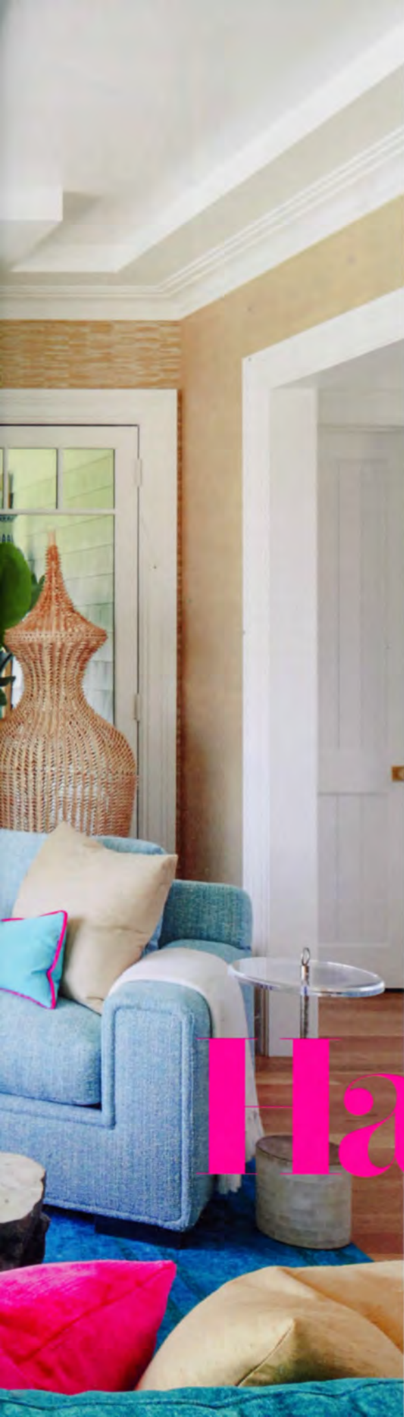
FOYER 1 GREG MCKENZIE